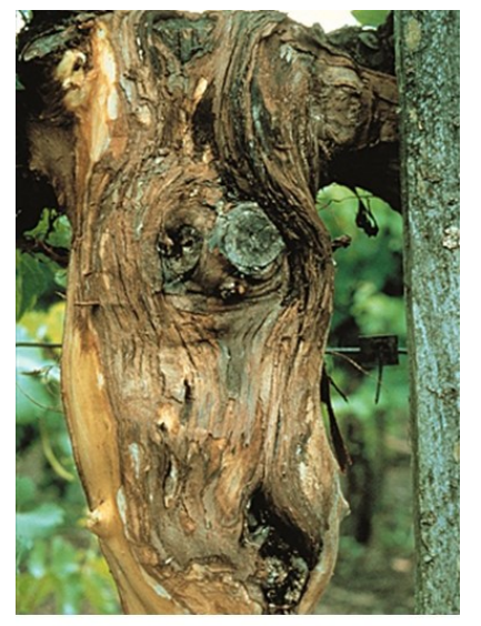
Figure 2. Large canker of Eutypa dieback surrounding an old pruning wound on a trunk. (Courtesy APS; Moller and Kasimatis, 1981).

Infections are initiated when ascospores enter freshy made wounds. Rain is a requisite for the release of ascospores and, after aerial transport and deposition, for their entry into the open end of vessels exposed by pruning. The susceptibility of wounds diminished markedly during the two weeks following pruning, and after four weeks the wounds are unlikely to be infected.