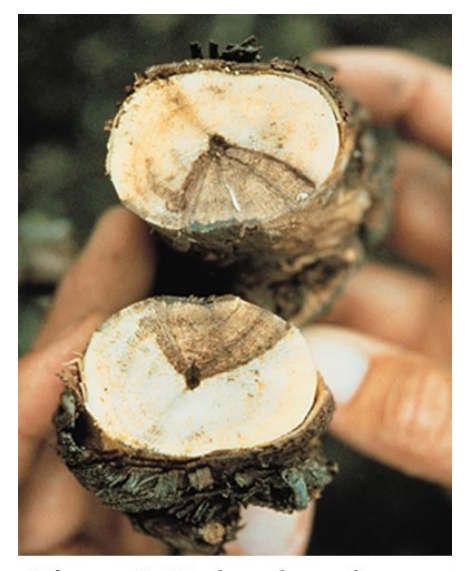
Figure 3. Wedge-shaped zone of necrotic sapwood, exposed in cross section, indicating the extent of invasion by <u>Eutypa</u> <u>lata</u>. (Courtesy APS; Moller and Kasimatis, 1981).

Sanitation is critical. All woods from infected plants should be removed from the vineyard and destroyed as soon as possible. An old infected stump or trunk lying on the ground may continue to produce spores for several year.