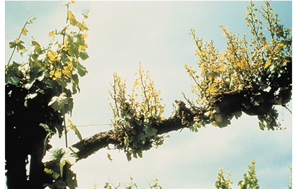
Figure 1. Stunted shoots with shortened internodes of a grape vine with Eutypa dieback. (Courtesy APS; Moller and Kasimatis, 1981).

The earliest symptom develops is a canker that generally forms around pruning wounds in older wood of the main canker (Figures 1 and 2). These cankers usually are difficult to see because they are covered with bark. One indication of a canker is flattened area on the trunk. Removal of bark over the canker reveals a sharply defined